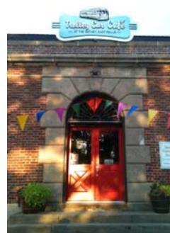
Type caption text The Trolley Car Cafe sits in a Fairmount Park building overlooking the Schuylkill River

If you are movin' and shakin', simply place an order to go for easy pickup. The menu offers healthy options and numerous build-your-own selections using the freshest ingredients possible. It's the place to be for breakfast, lunch or dinner, after a stroll, or before a night out on the town. The Café is also home to a groovy on-site bike rental and repair shop to keep you rollin'! 7am to 10pm. Let them take you back to your childhood with locally made Nelson's ice cream served all day while you enjoy all the benefits of the "modern 50's" with free wireless internet, BYOB, family-friendly dining and plenty of $.50/hour parking!